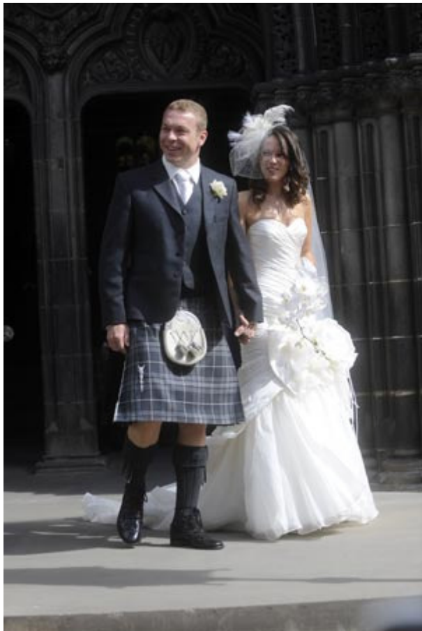
Chris Hoy wore a kilt on his wedding day.

In a poll of international traditional clothing, 67 per cent of respondents put the kilt in top position, with many women describing it as "very attractive" on a man.