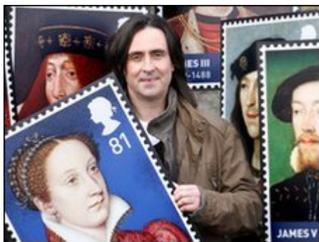
The stamp set features seven monarchs from the house of Stewart

It is one of a series showing the seven Stewart kings and queens who ruled Scotland from 1406 until the Union of the Crowns with England in 1603.