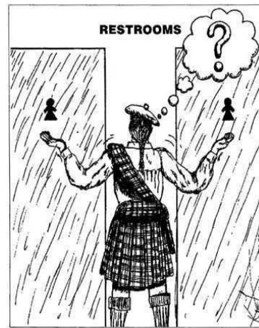
The problem with bathrooms in Scotland

American: "In Scotland, the men eat oatmeal; here in America we feed it to our horses." Scot: "That's why American horses and Scottish men are the finest in the world."